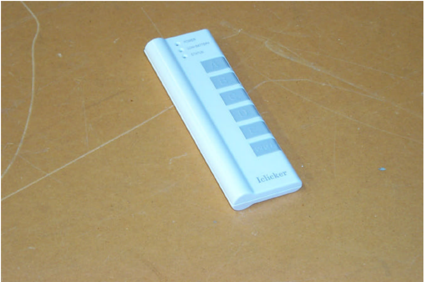
Figure 1 - EUT External View, Front Side