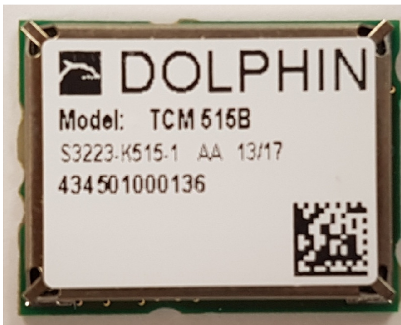
Figure 2: Top view of module