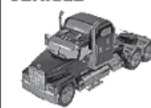
MACK® Rawhide With Mid Rise Sleeper