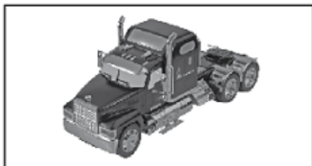
MACK® Rawhide With Mid Rise Sleeper