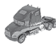
MACK® Vision With Hi Rise Sleeper