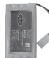
9.6V Ni-Cd BATTERY PACK