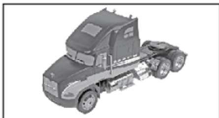
MACK® Vision With Hi Rise Sleeper