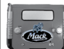
CONTROLLER (1 9V battery included)