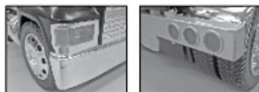
Both With Working Headlights and Taillights