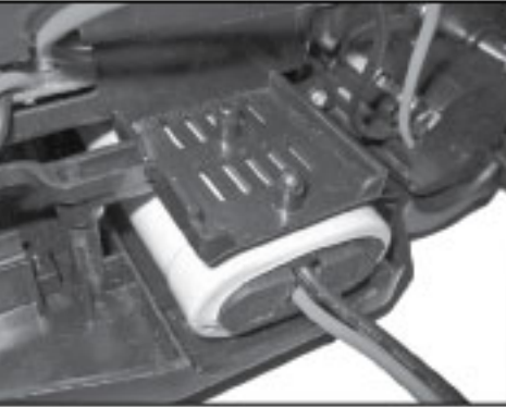
4. Insert the battery