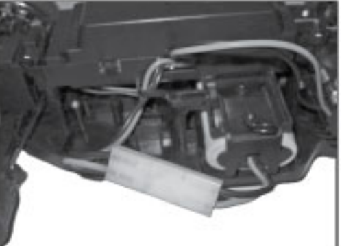
5. Clip in the battery cover and plug the battery connector