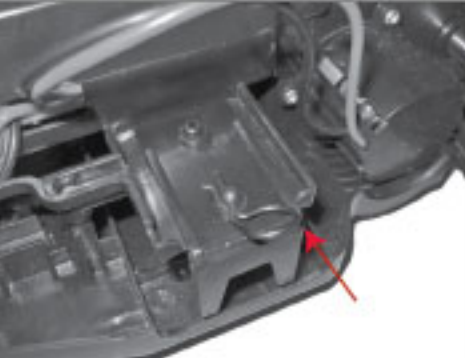
2. Take out the clip