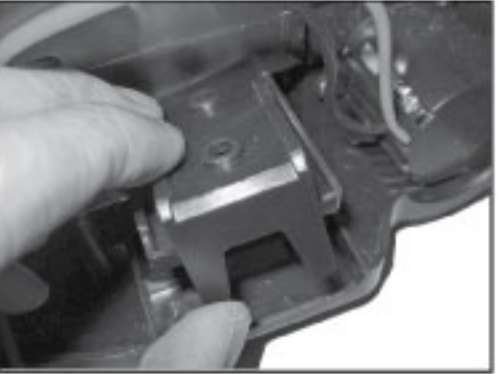
3. open the battery cover