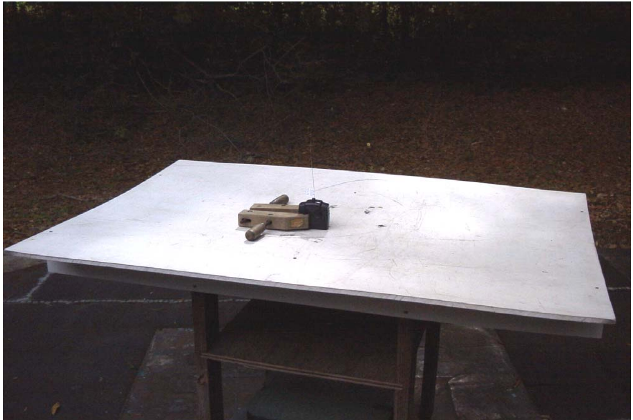
TEST SET UP PHOTO

888.472.2424 F 352.472.2030 email: tei@timcoengr.com