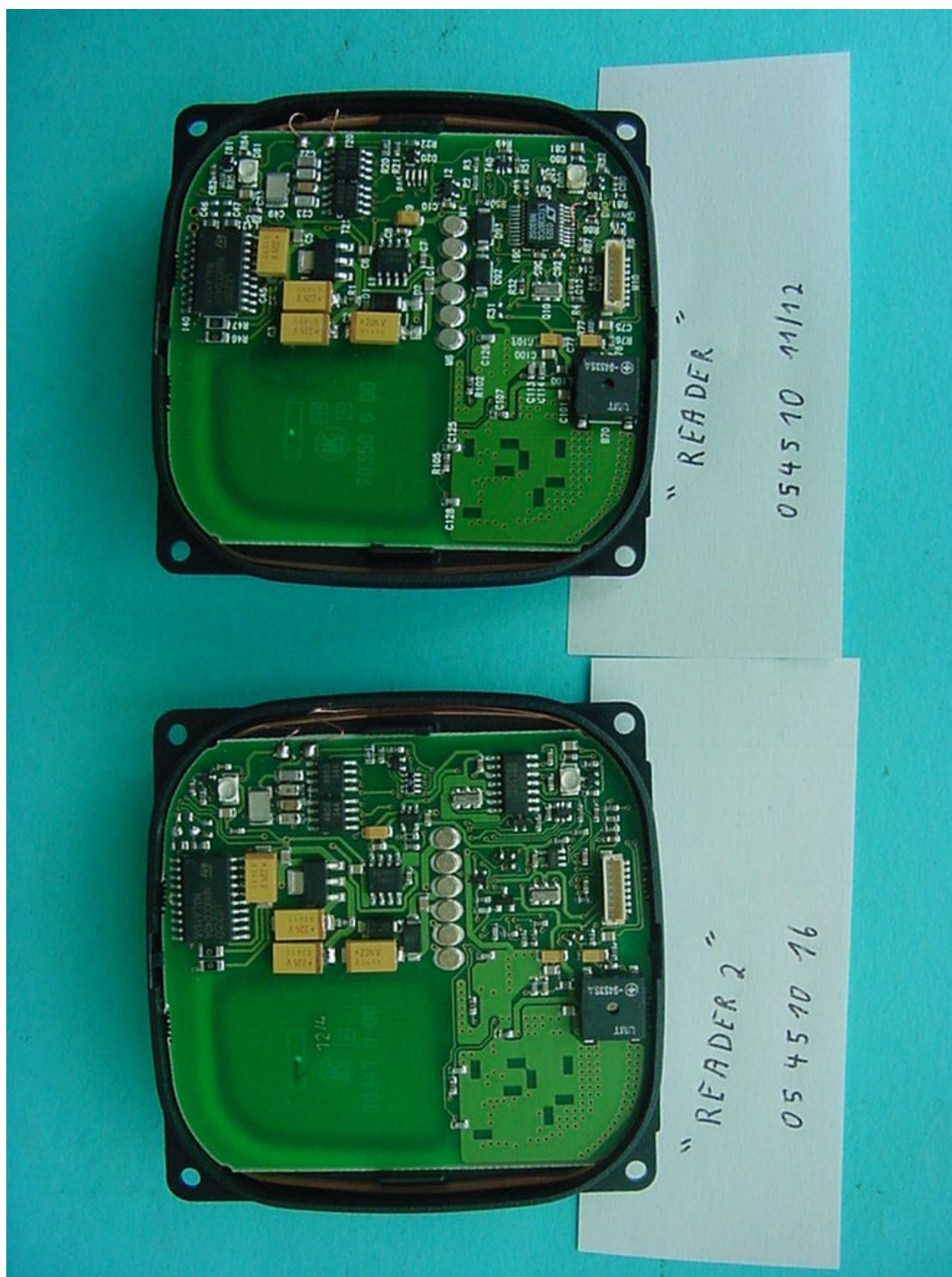
Photograph no.: 1