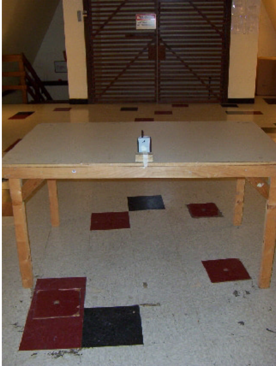
Radiated Emission Test Setup – Rear View (Vertical Straight Up)