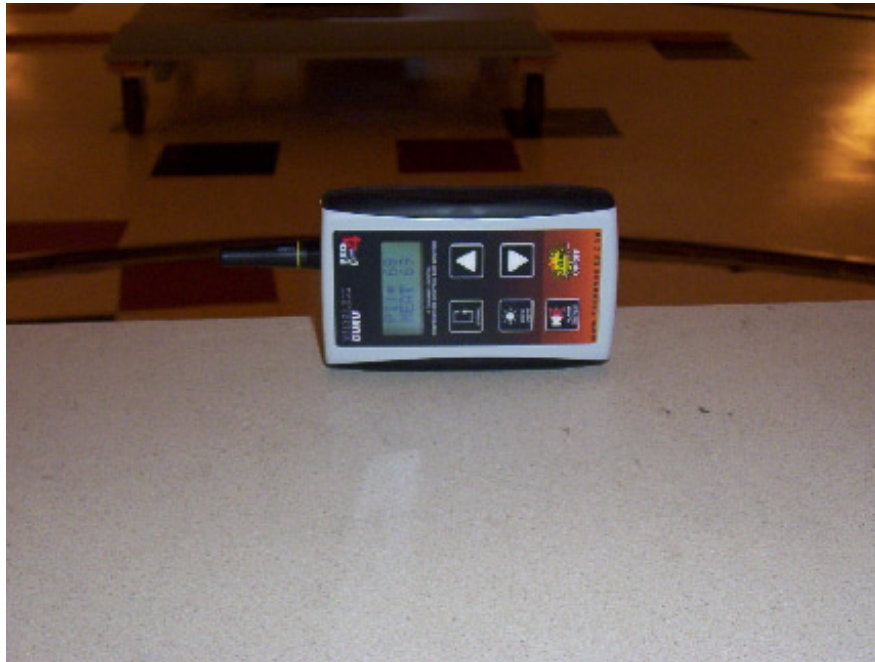
Radiated Emission Test Setup – On Left Side