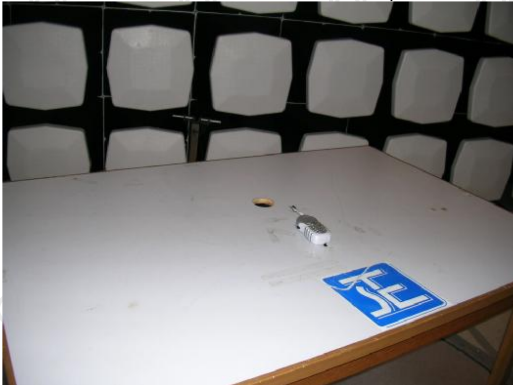
Measurement of Radiated Emission Test Set Up