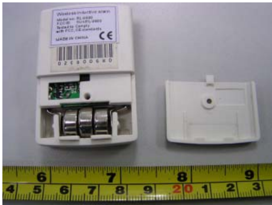
EUT - Uncovered View (2)