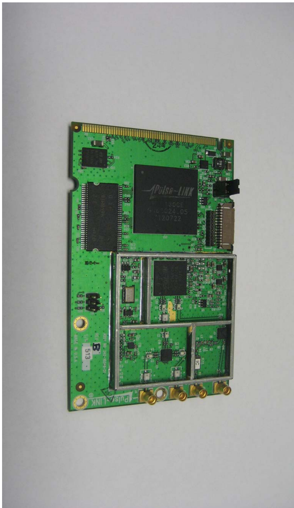
Figure 3. Top side of PL3301 with shield removed.

"When we were young, we wanted to change the world...now we have the technology"™