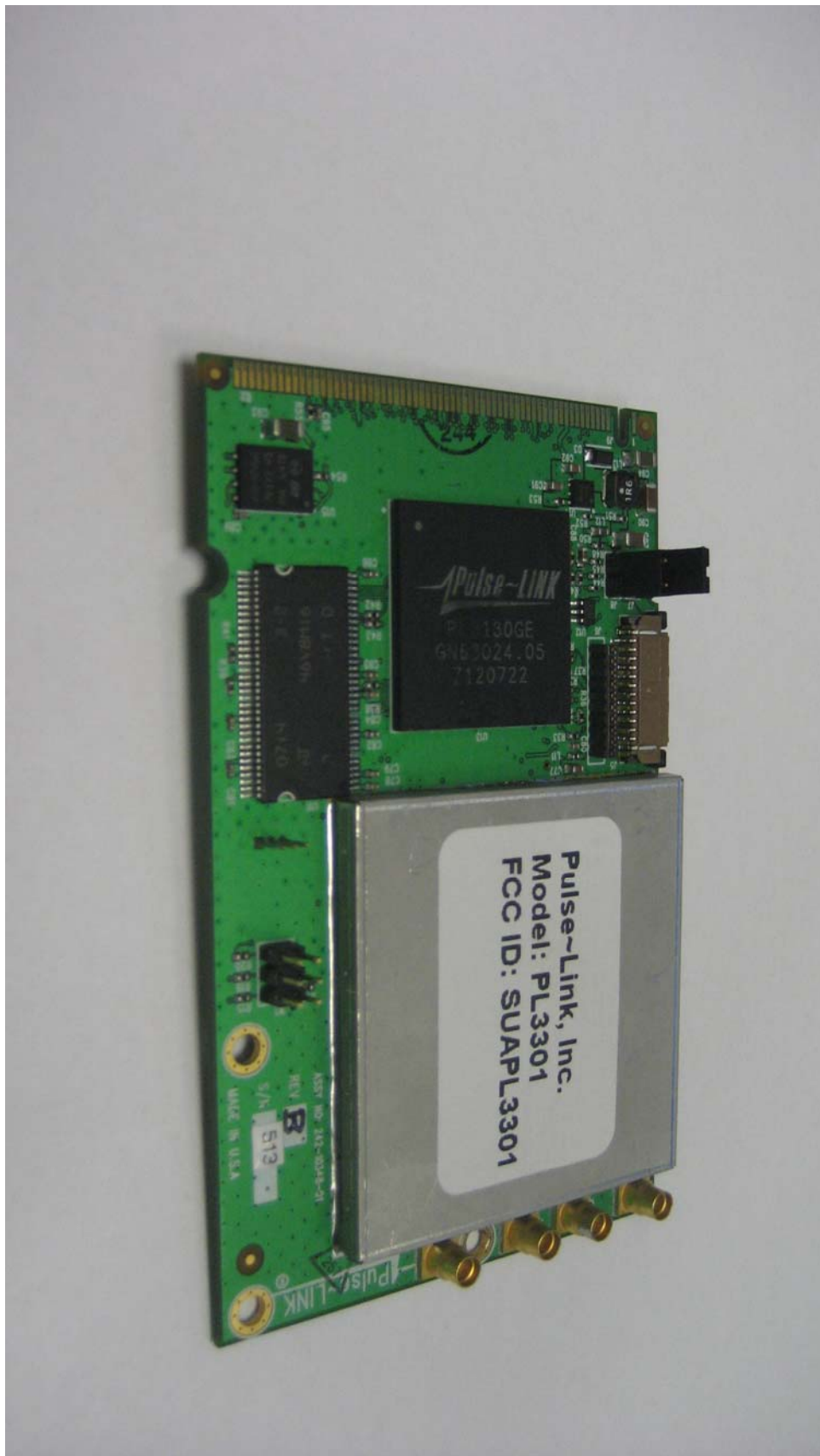
Figure 1. Top side of PL3301 with the shield on.

"When we were young, we wanted to change the world...now we have the technology"™