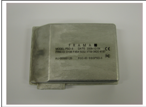
Figure 1: Position of the PSD-II label

The PSD-II is marked with an adhesive label. The label is located on the top side of the enclosure. (figure 1)