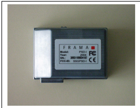
Figure 1: Position of the PSD-I label

The PSD-I is marked with an adhesive label. The label is located on the top side of the enclosure. (figure 1)