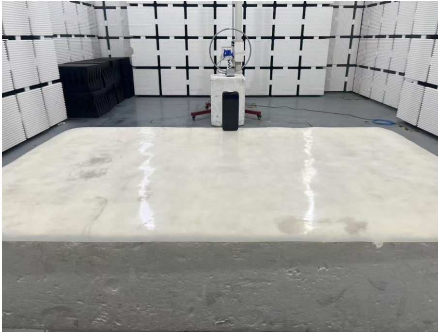
Set-up for Transmitter & Receiver Spurious Emissions, 30MHz to 1000MHz