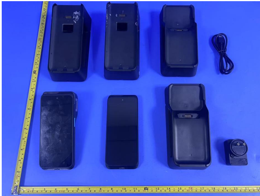
Configuration 1 Photo 2