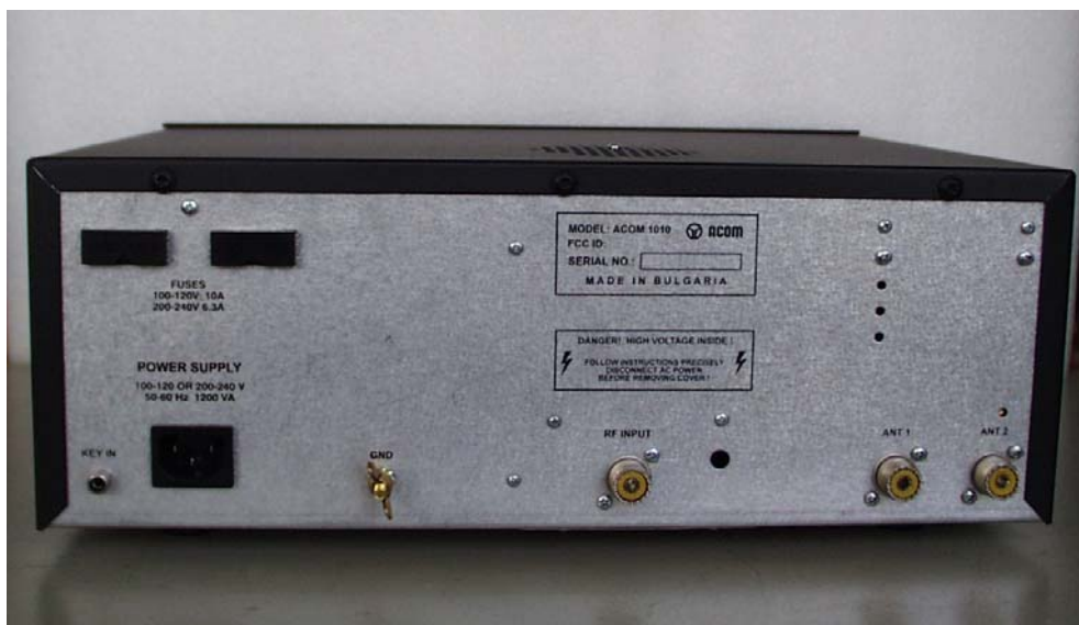
Fig.1 Label location