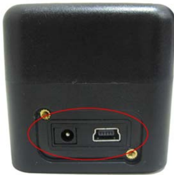
Power connector and mini USB connector