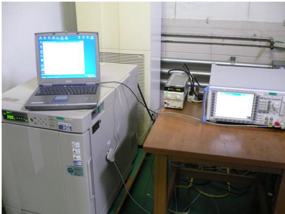
Temperature test (Frequency stability)