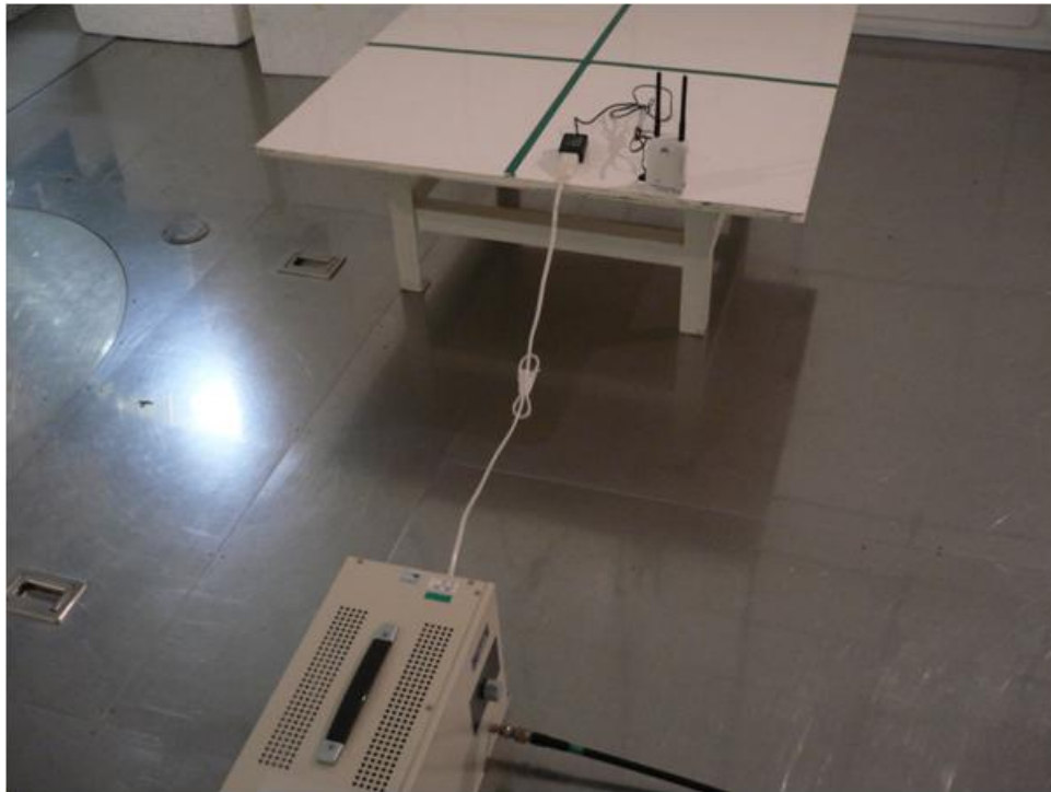
AC Line Conducted emission