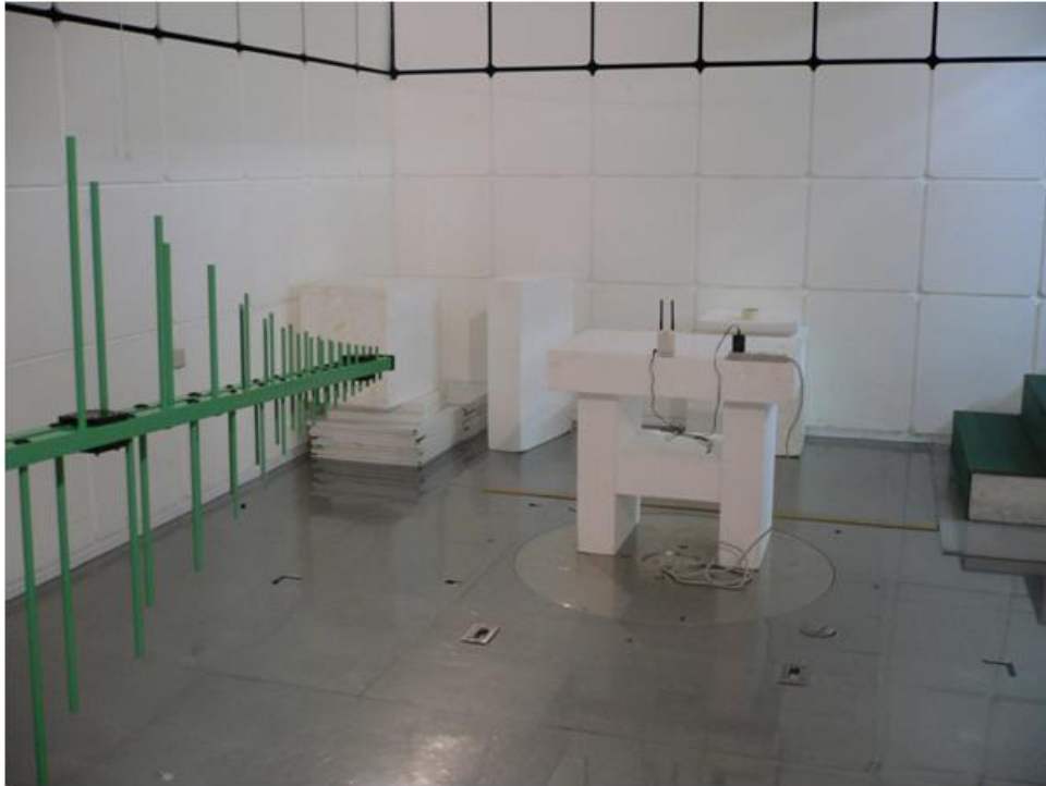
Radiated emission 1