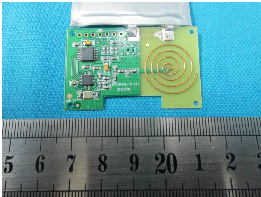
Front View of PCB