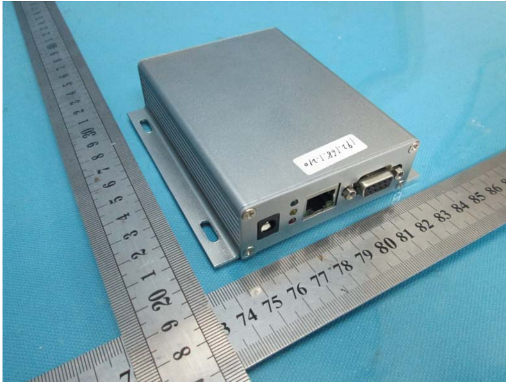
Internal View of EUT