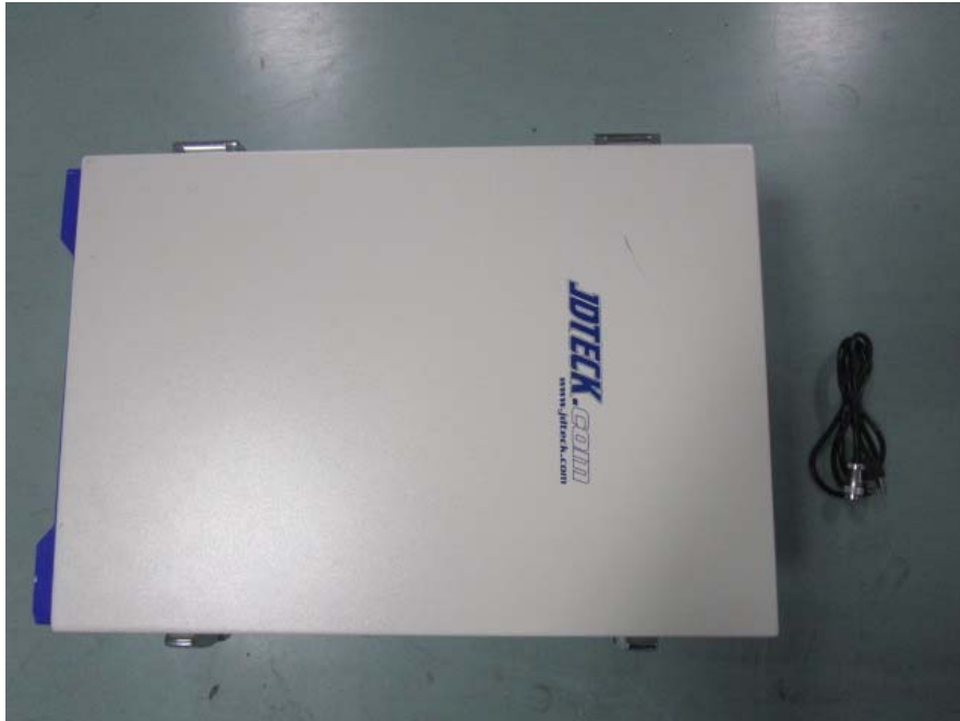
EUT –Top View