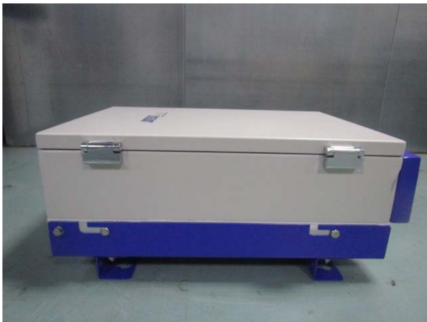
EUT –Port View