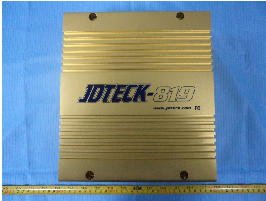
EUT – Front View