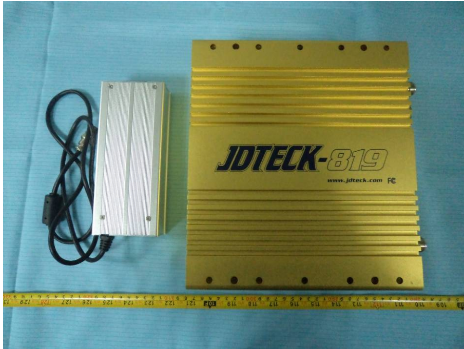
EUT – Top View