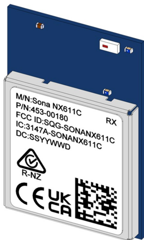
Figure 1: Sona NX611 M.2 1218 Chip Antenna SMT Module

Note: Data in this document is drawn from several sources and is subject to change.