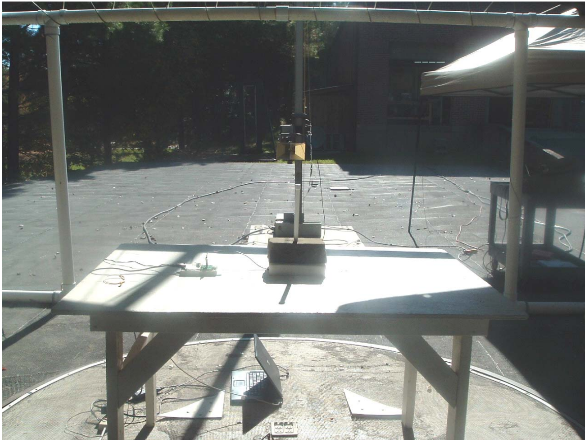
Figure 2: Radiated Test Configuration Antenna 1 Omni Antenna 5.0dBi Gain (Rear View)

FCC Part 15 Class II Permissive Change SQB-NIVISMOD0001 09-0189 November 13, 2009 Nivis, LLC 2.4GHZ MOD2