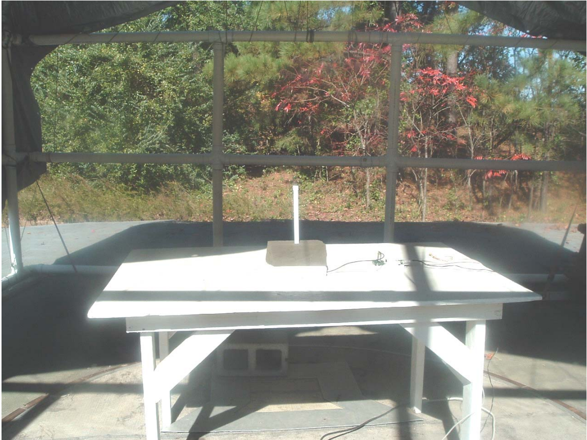
Figure 1: Radiated Test Configuration Antenna 1 Omni Antenna 5.0dBi Gain (Front View)