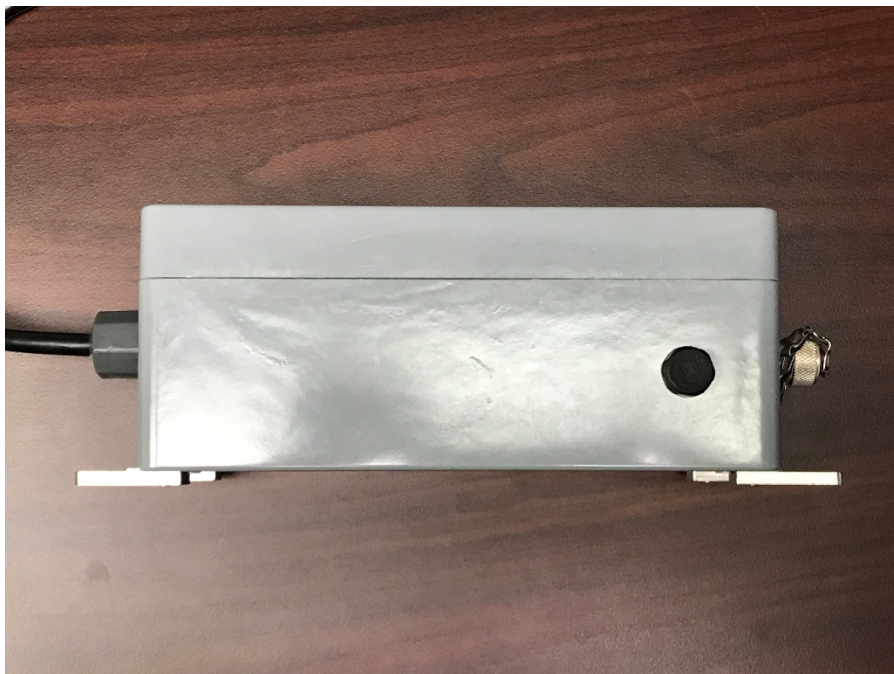
Figure 3 - Back View of IMN