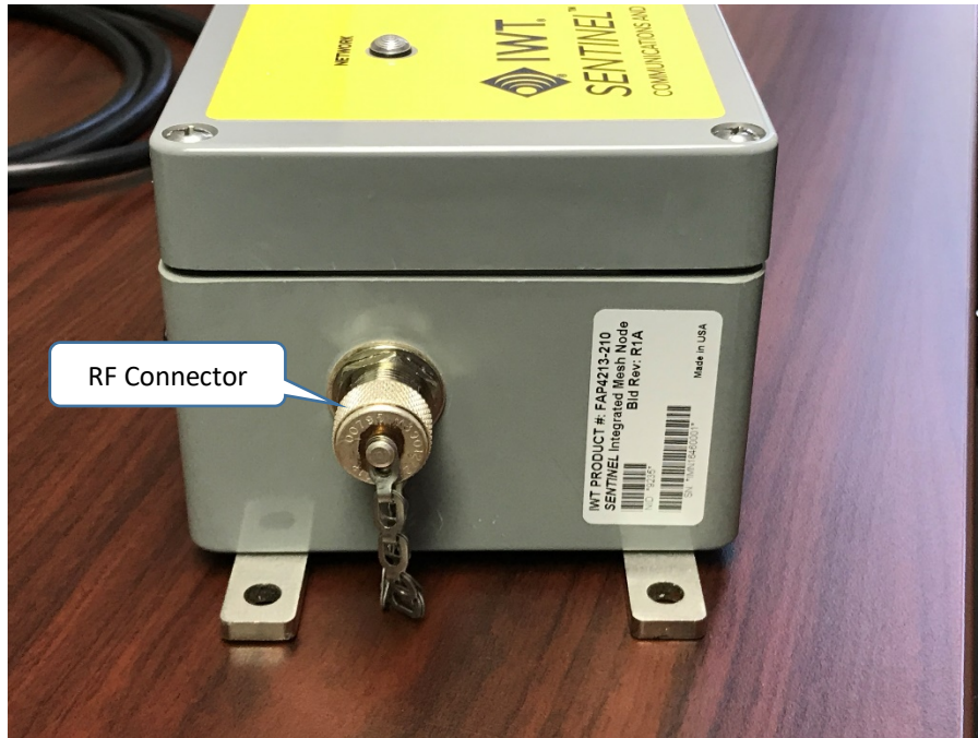
Figure 5 – Left View of IMN