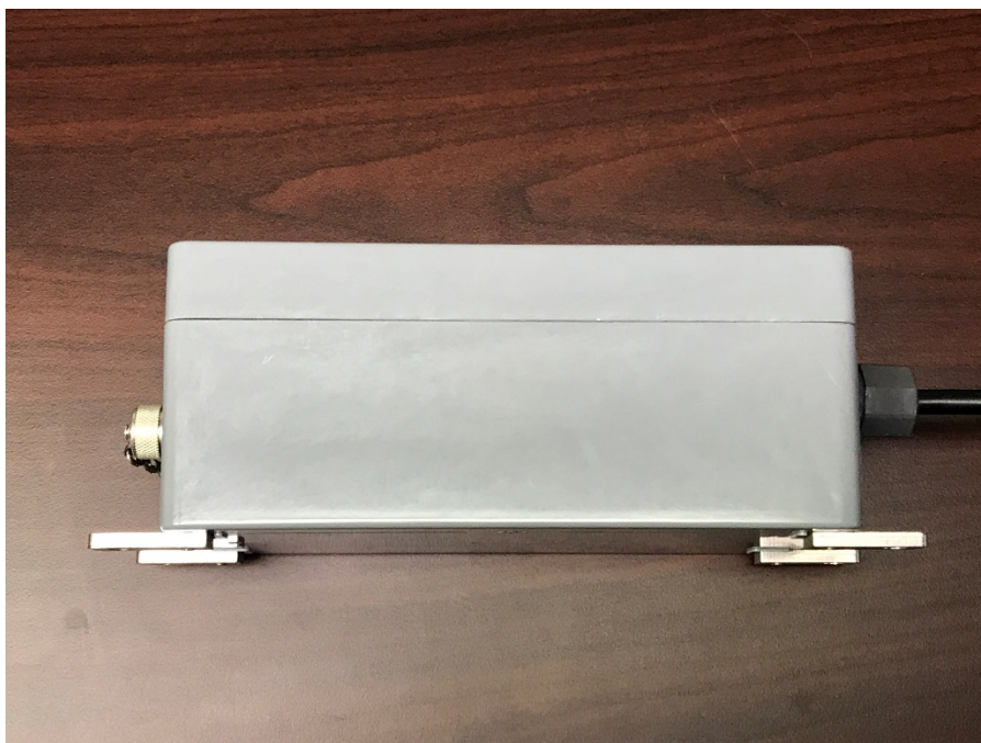
Figure 4 - Front View of IMN