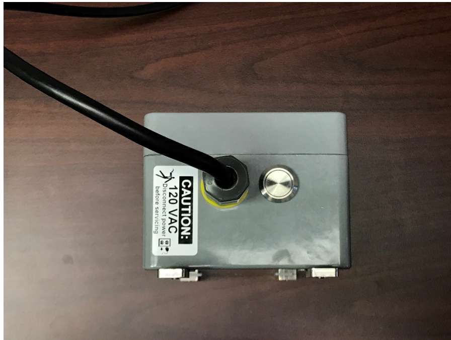
Figure 6 - Right Side View of IMN