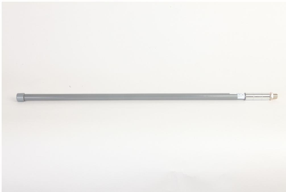
Figure 8 - Omni-directional dipole antenna