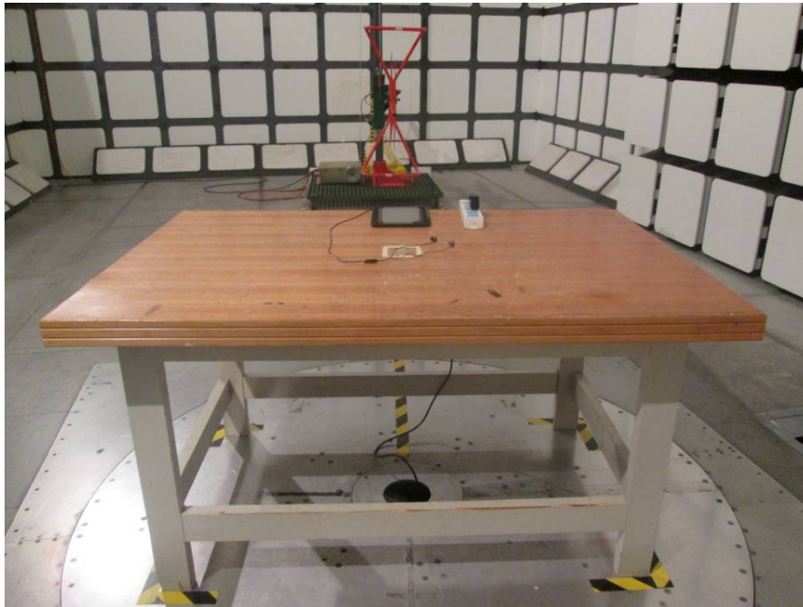
Radiated Emissions – Rear View (30-1000 MHz)