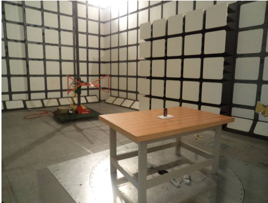
Above 1 GHz: Radiated Emissions