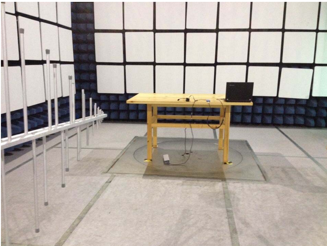
30MHz to 1GHz