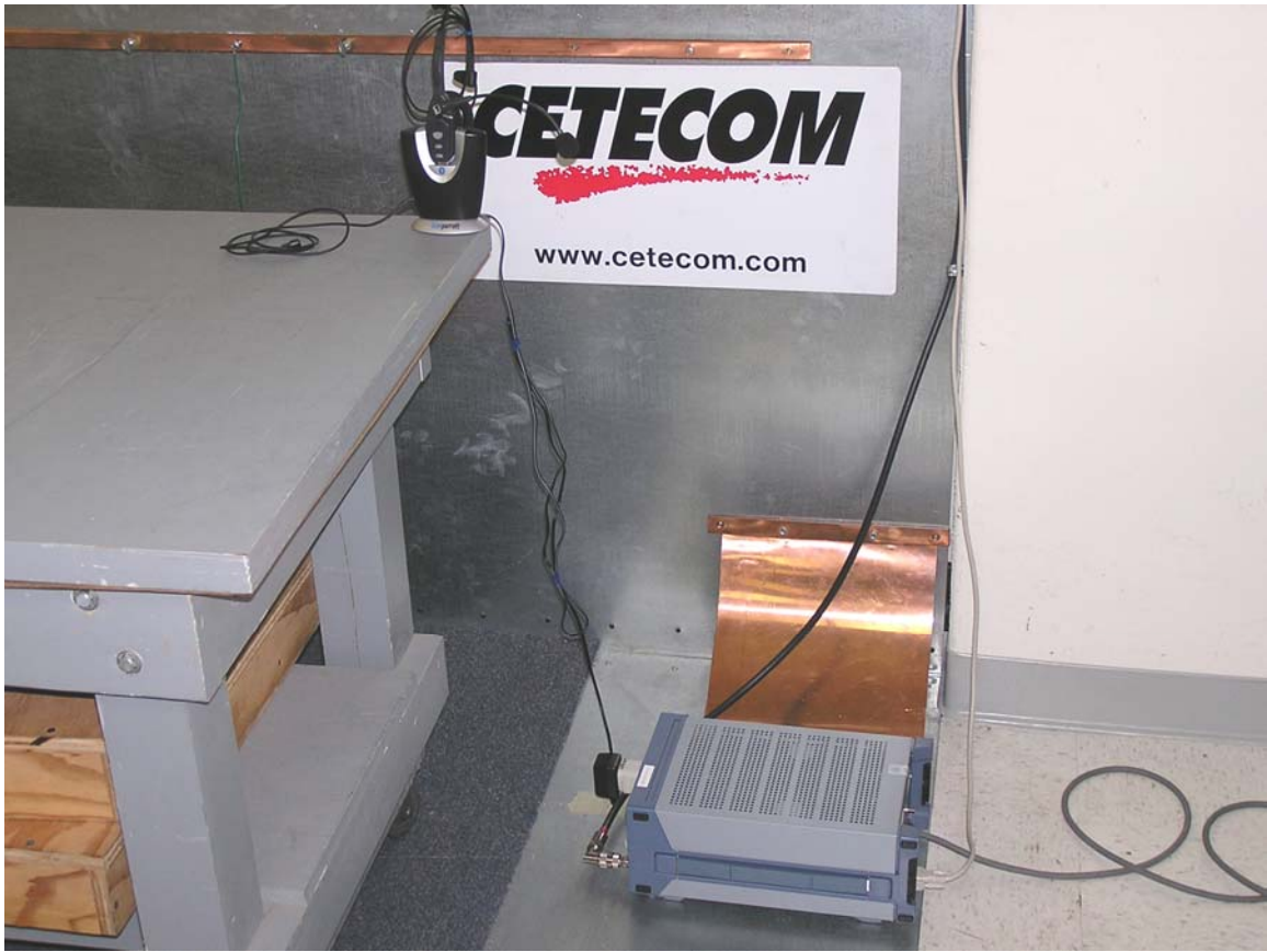
Test Set up – AC Line Conducted Emissions