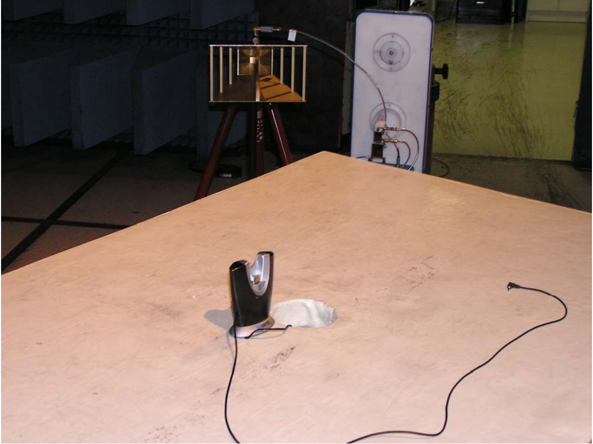
Test setup – Radiated Emissions