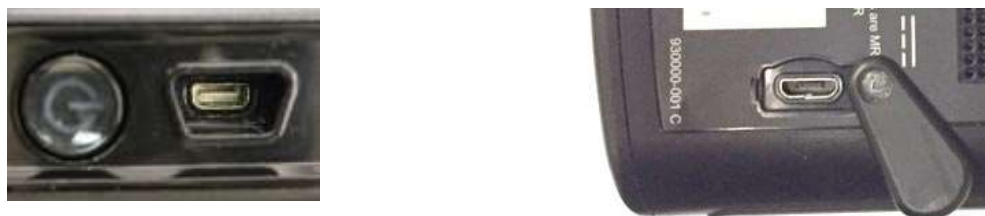
Figure 5. Argus 2s VPU – Detail: Cable ports

Left: Connector for cable to Glasses; Right: Connector for cable to computer (for programming, etc.)