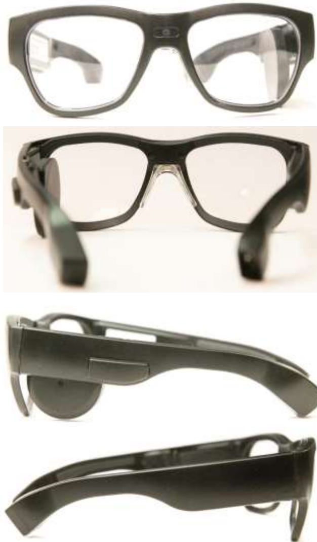
Figure 2. Argus 2s Glasses (model with clear lenses)