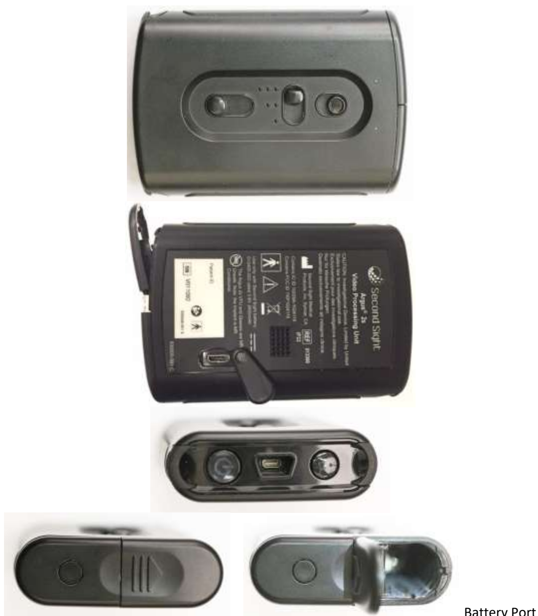
Figure 4. Argus 2s VPU (Video Processing Unit)