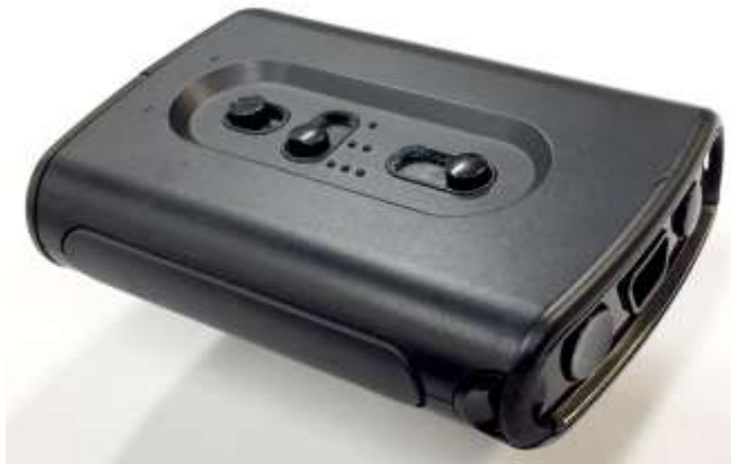
Figure 6. Argus 2s VPU - side / perspective views