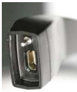
Figure 3. Argus 2s Glasses – Detail: Cable port

(Note: The pin is to mechanically secure the connector attachment, it has no electrical functionality)