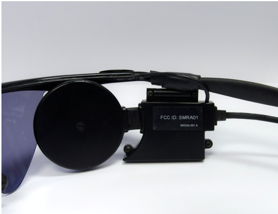
Figure 5. FCC ID marked on RF electronics housing on Argus II glasses.