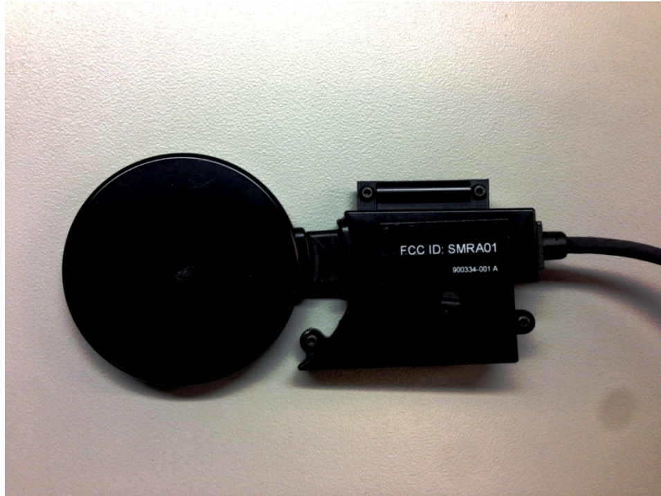
Figure 6. FCC ID marked on RF electronics housing on Argus II OR Coil.