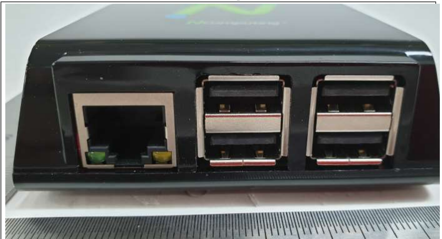
<USB LAN port>