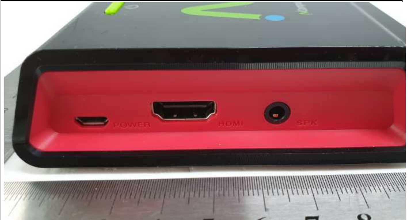
<HDMI Powr port>