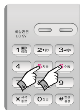
Press 5 to auto locking Press 6 to manual locking