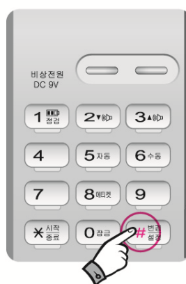
Press button[ # ]