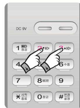
Press 2 to volume down Press 3 to volume up