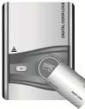
Touching unregistered digital key over 5 successive times