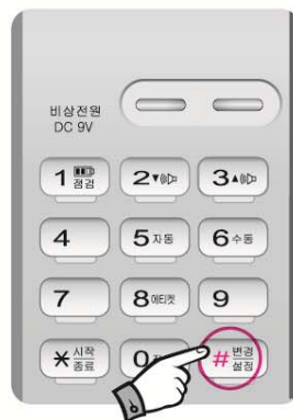
Press button[ # ]