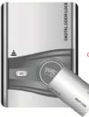
Touch Digital Key