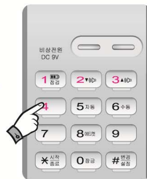
Press secret code (For example: 1234)