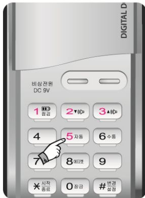
Pressing the wrong password five times successively

If anyone tries hacking through the combination of passwords for the purpose of mischief or breaking in, it generates alarm sound and blocks input for a specific time recognizing not registered password or digital key over 5 successive times.