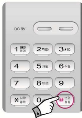
Press button[ # ]