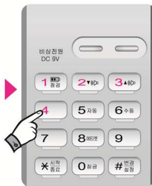
Enter secret code (For example: 1234)