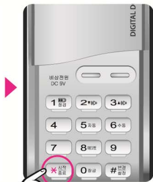
Press [*] to release