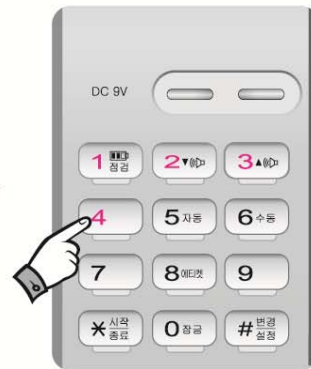
Press secret code (For example: 1234)