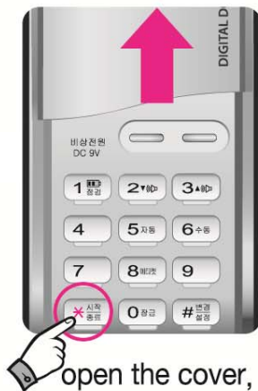
open the cover, press button [*]