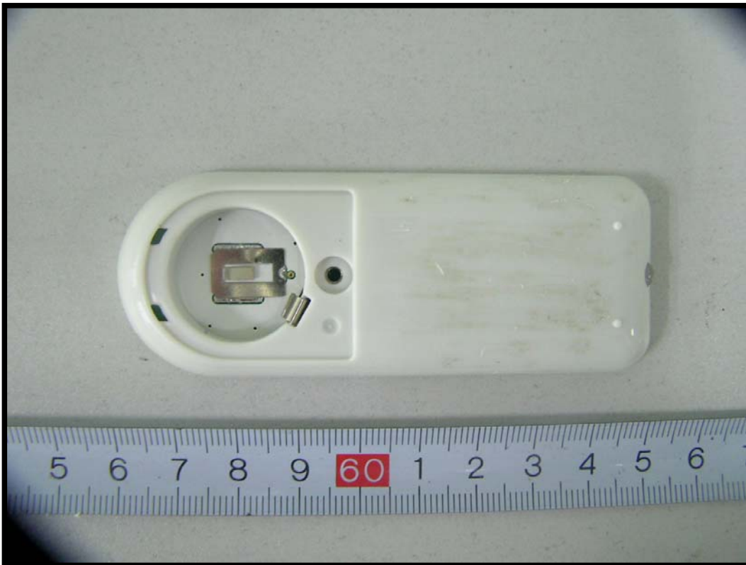
EUT –Uncovered View