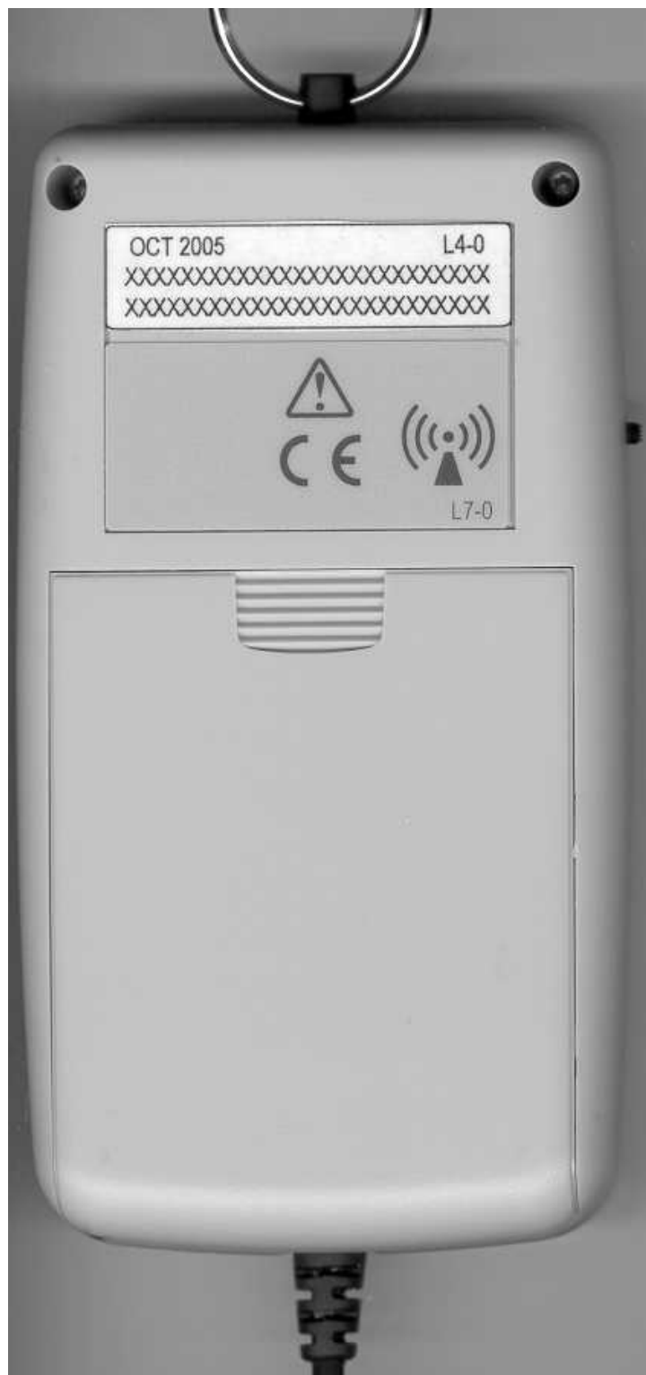
Photo: Case - Back