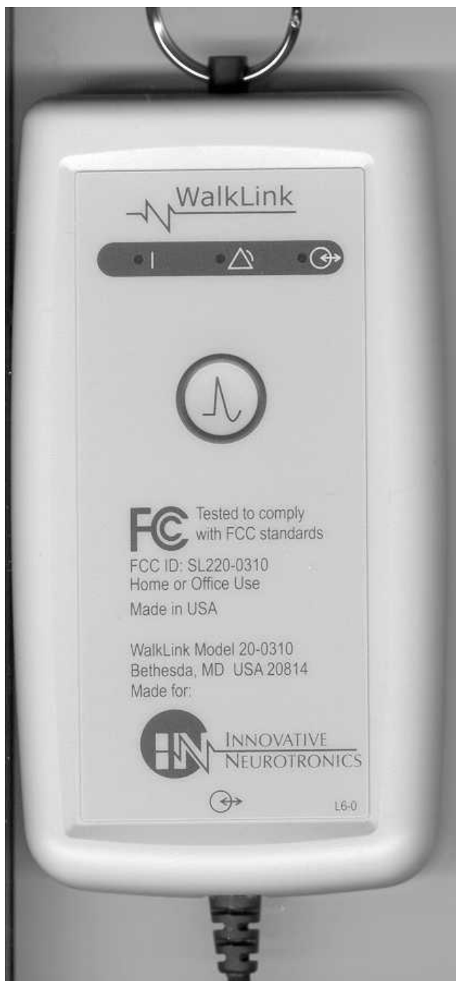
Photo: Case - Front