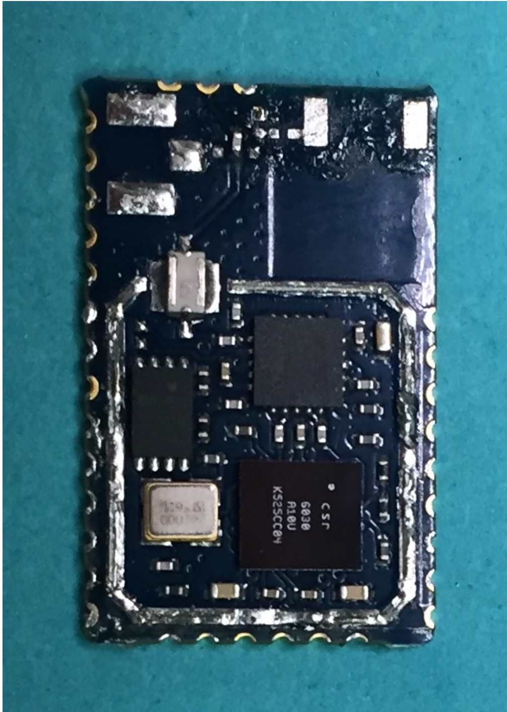
PCB Top View Without Shields