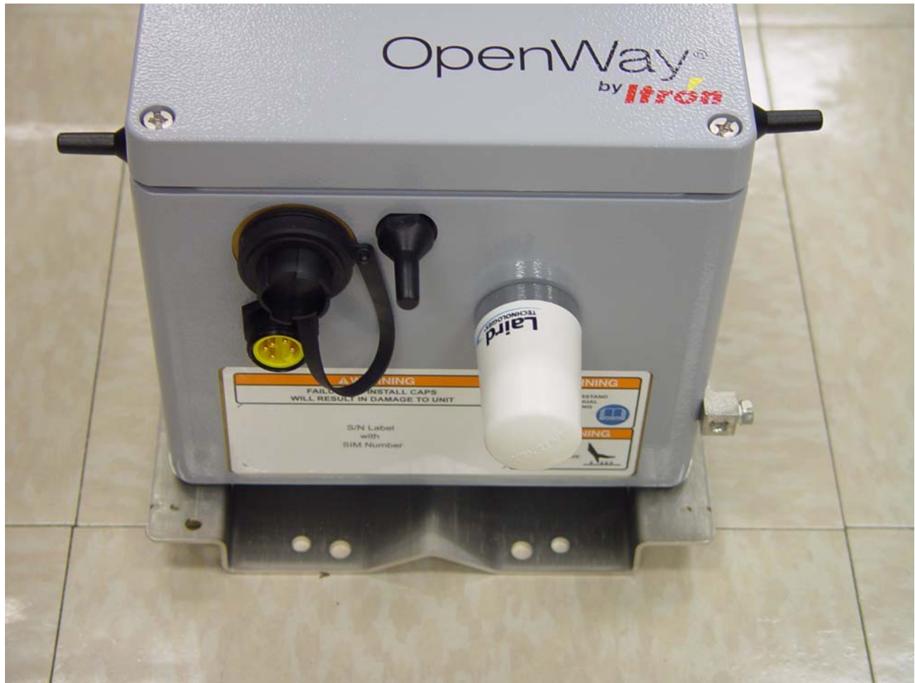
Figure 2: Label Location