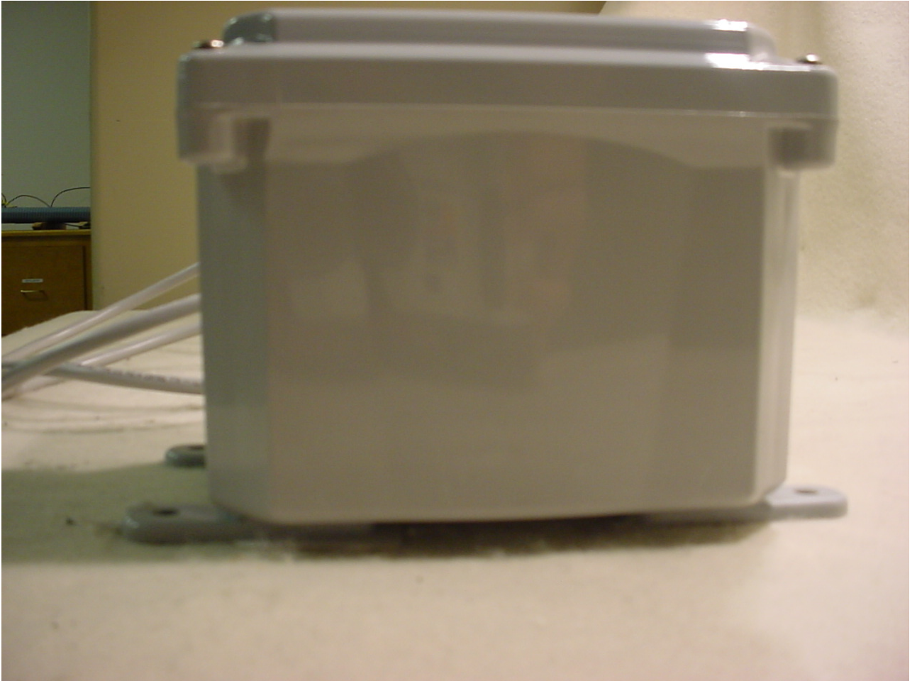
Figure 3: Host Side 1 View