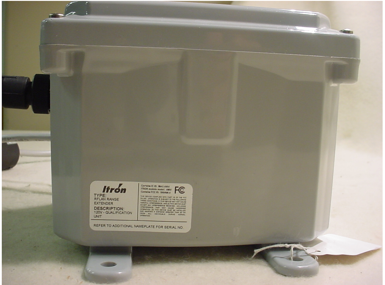
Figure 6 – Host Side 4 View