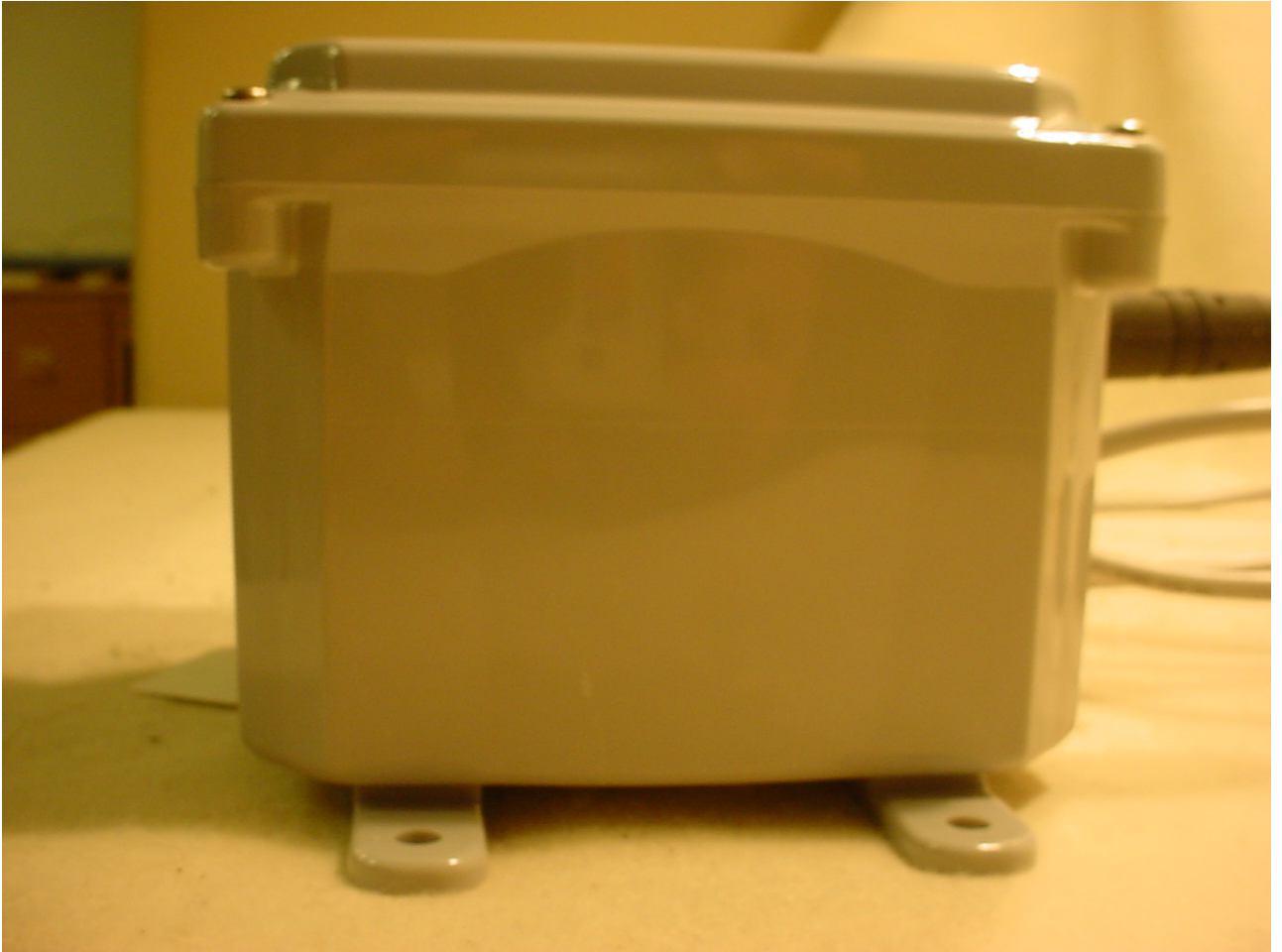
Figure 4 – Host Side 2 View