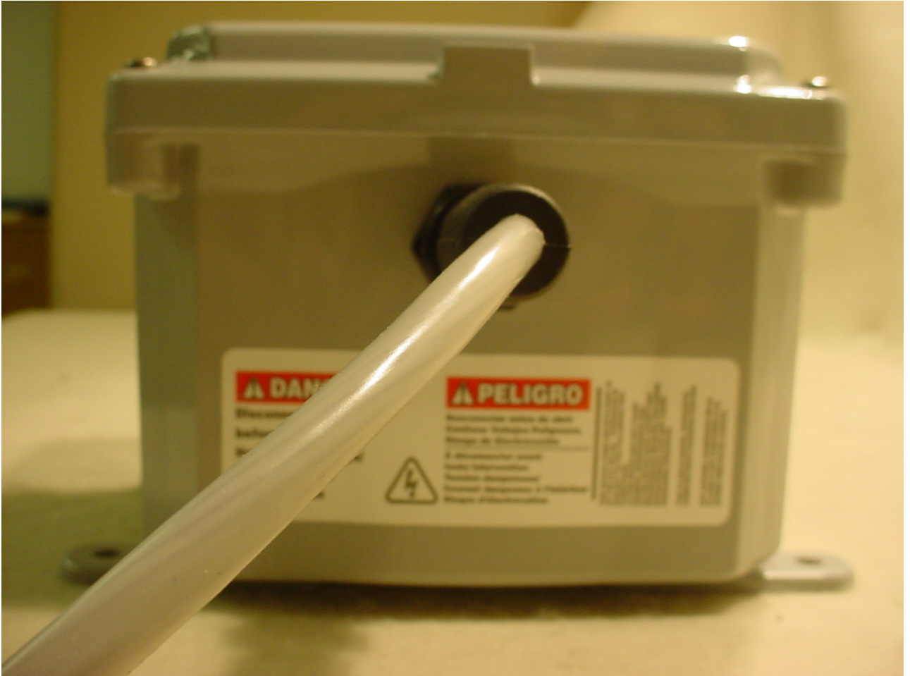
Figure 5 – Host Side 3 View