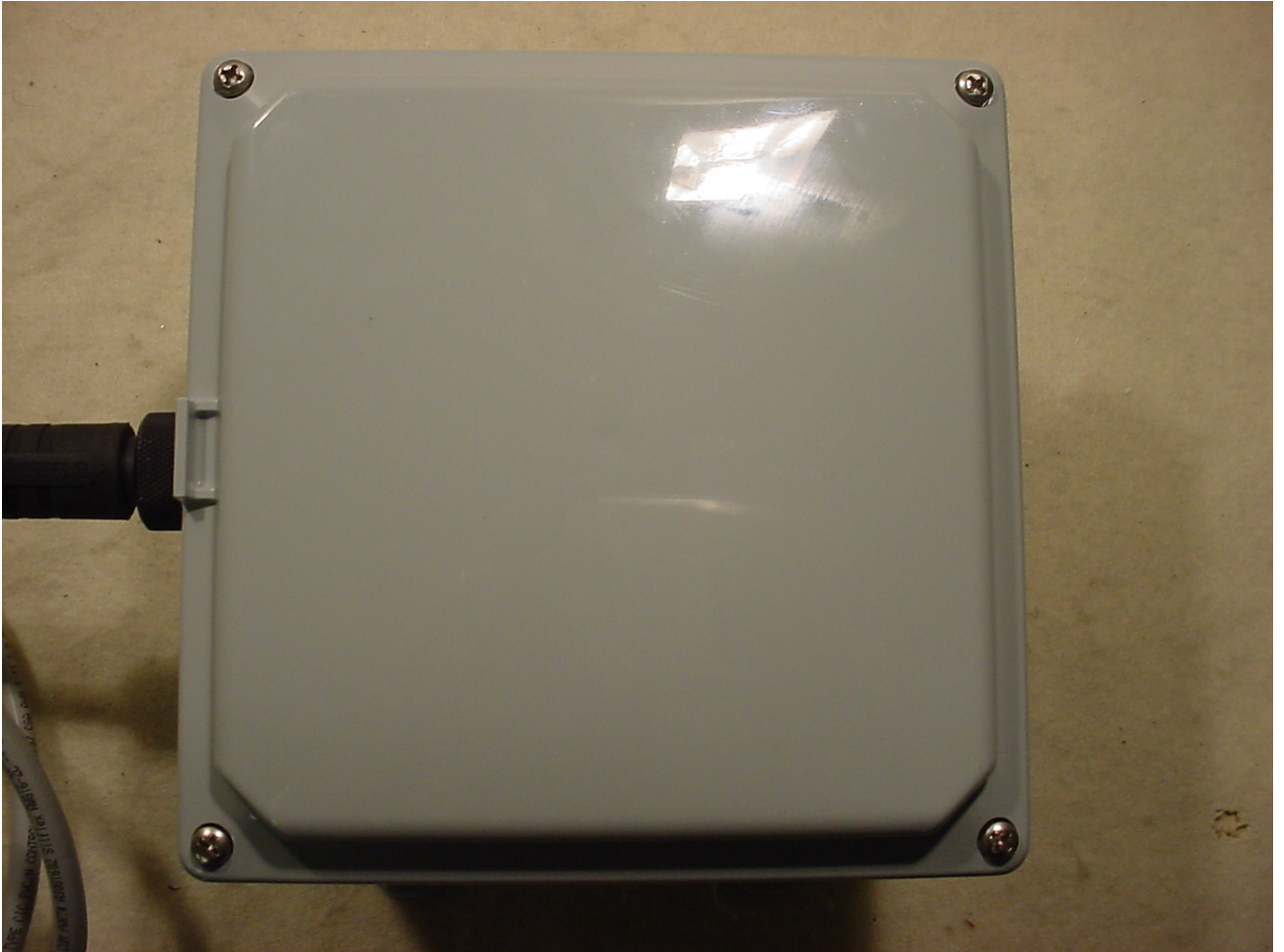
Figure 1: Host Top View