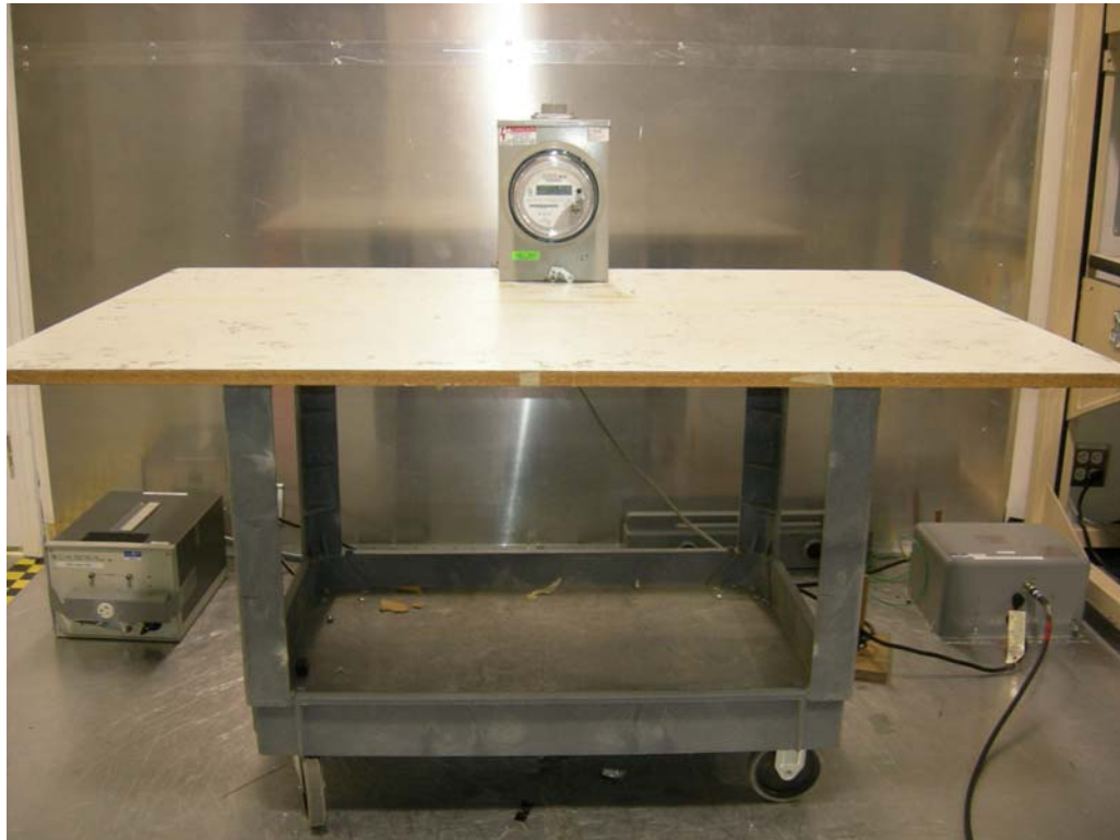
Figure 7: AC Power Line Conducted Emissions – Host 12S Meter Type