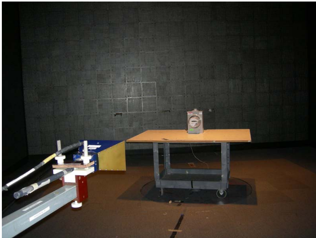
Figure 3: Radiated Emissions – Host 12S Meter Type