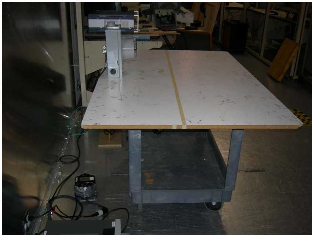
Figure 6: AC Power Line Conducted Emissions – Host 2S Meter Type