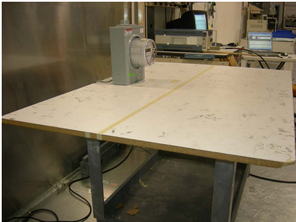
Figure 8: AC Power Line Conducted Emissions – Host 12S Meter Type