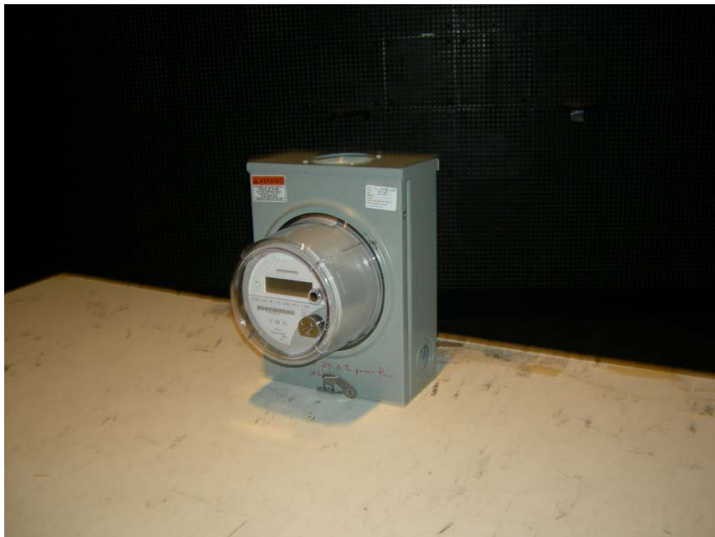
Figure 2: Radiated Emissions – Host 2S Meter Type