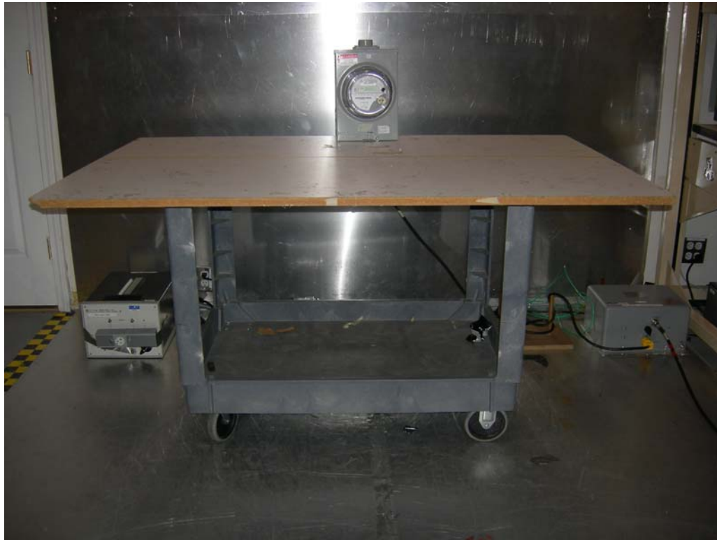
Figure 5: AC Power Line Conducted Emissions – Host 2S Meter Type