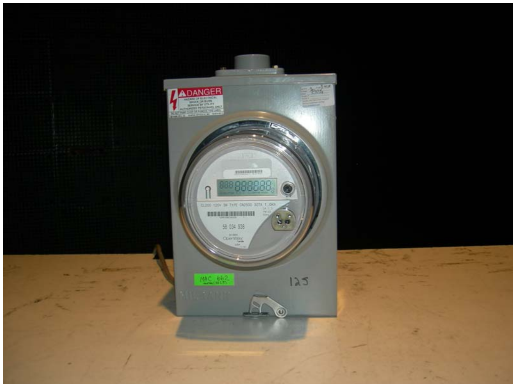
Figure 4: Radiated Emissions – Host 12S Meter Type