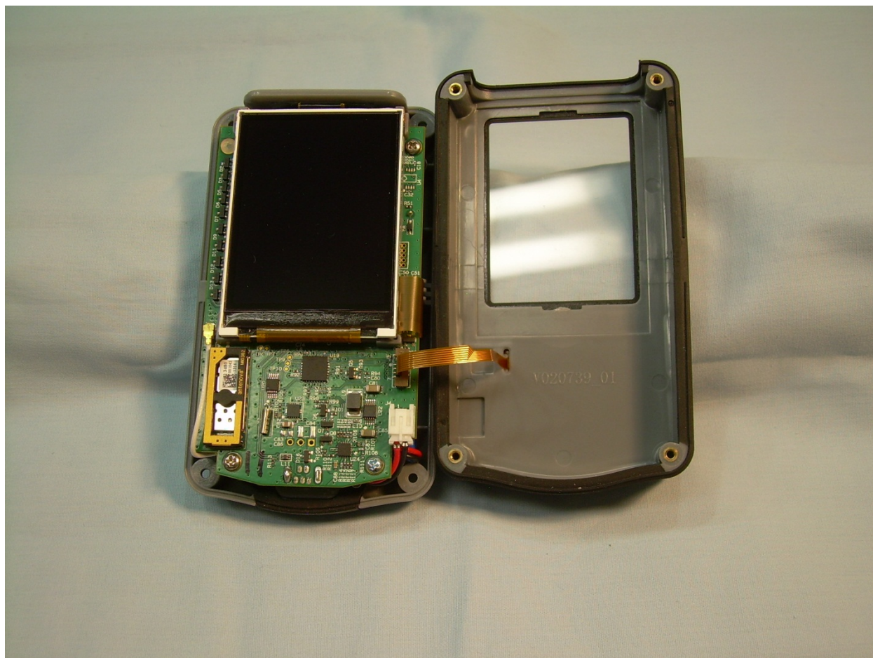
View of the EUT with Housing Opened