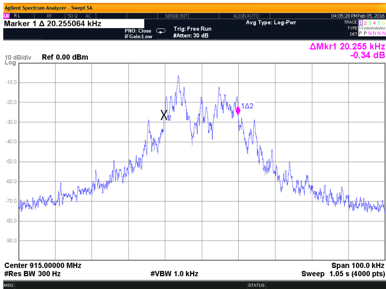
Figure 1: 20dB Occupied Bandwidth, Low Channel