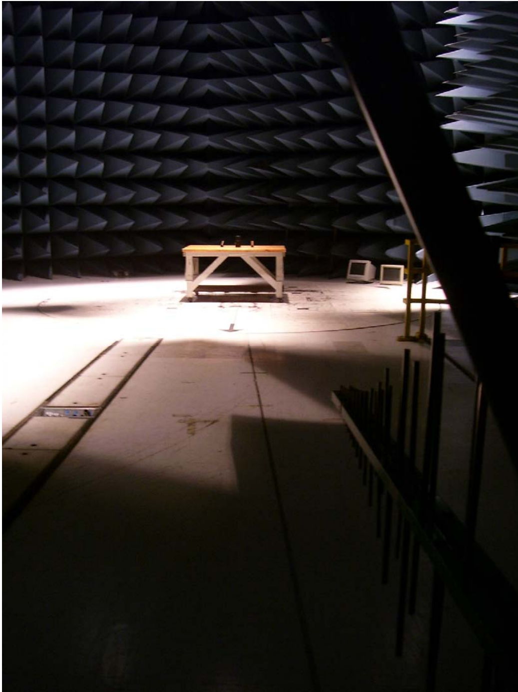
Photograph 2. Radiated Emission Test Setup – Front View