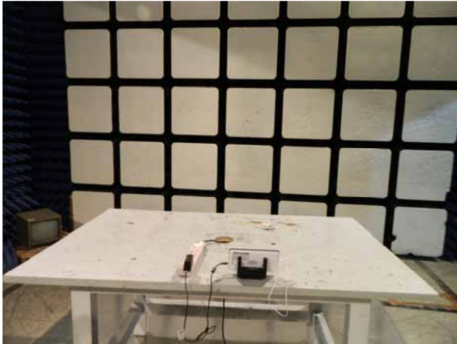
Line Conducted test setup: