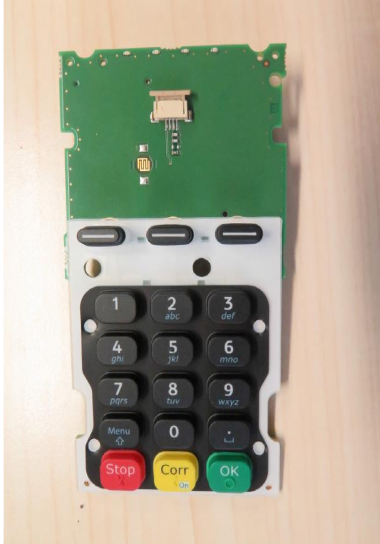
Photo 1: Keyboard PCB 041-120030-xx front side view