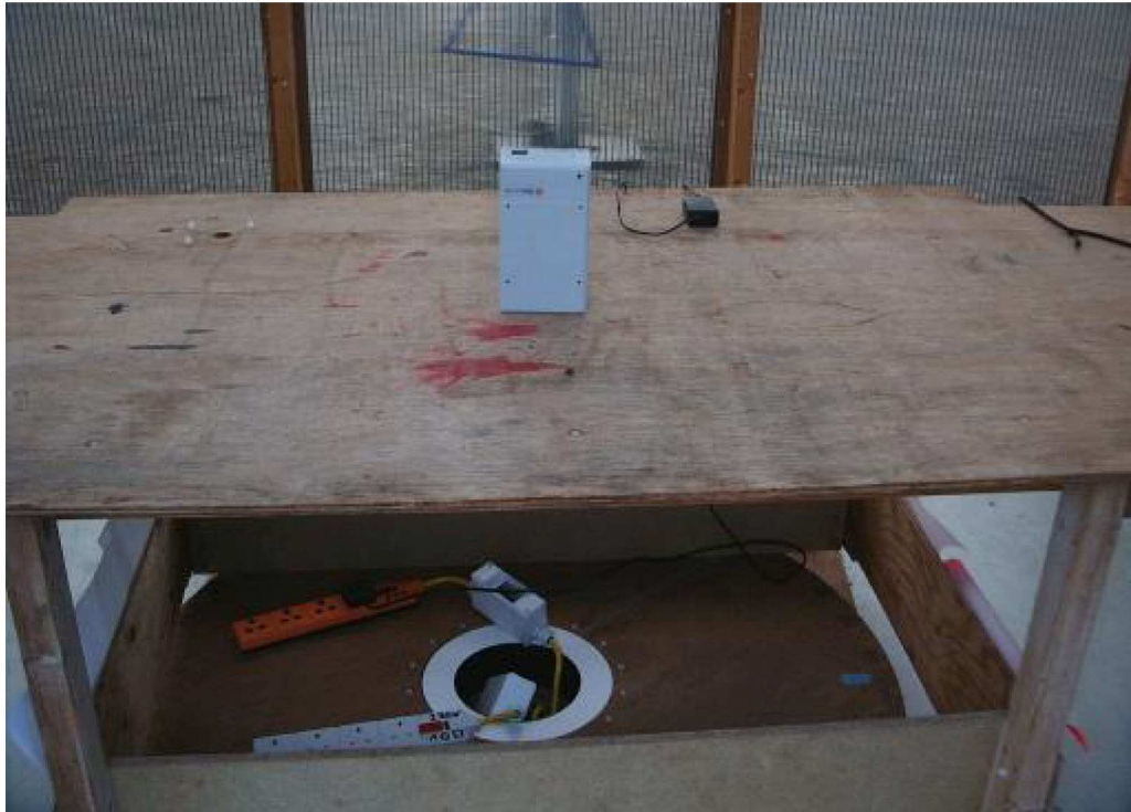
Photograph 3 Radiated Emissions - Front