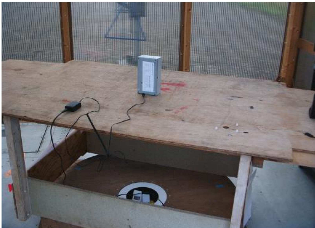
Photograph 4 Radiated Emissions - Back