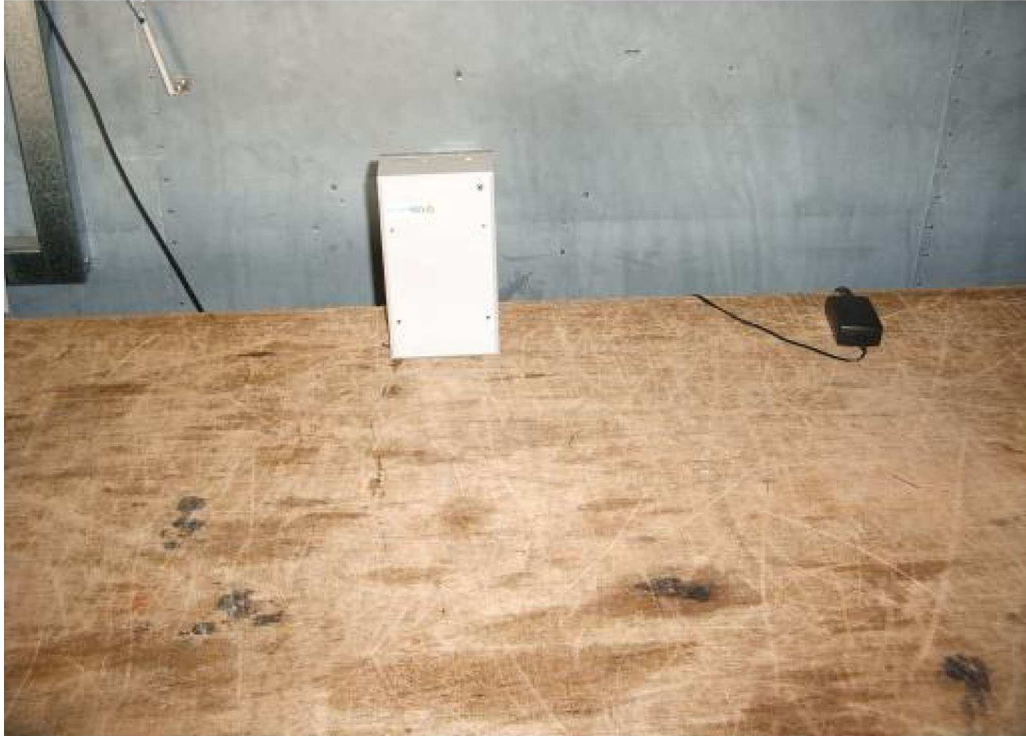
Photograph 1 Conducted Emissions - Front