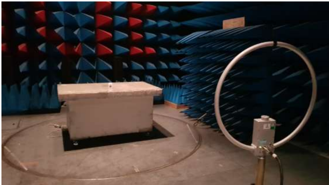
Photograph for Unwanted Emission in restricted frequency bands