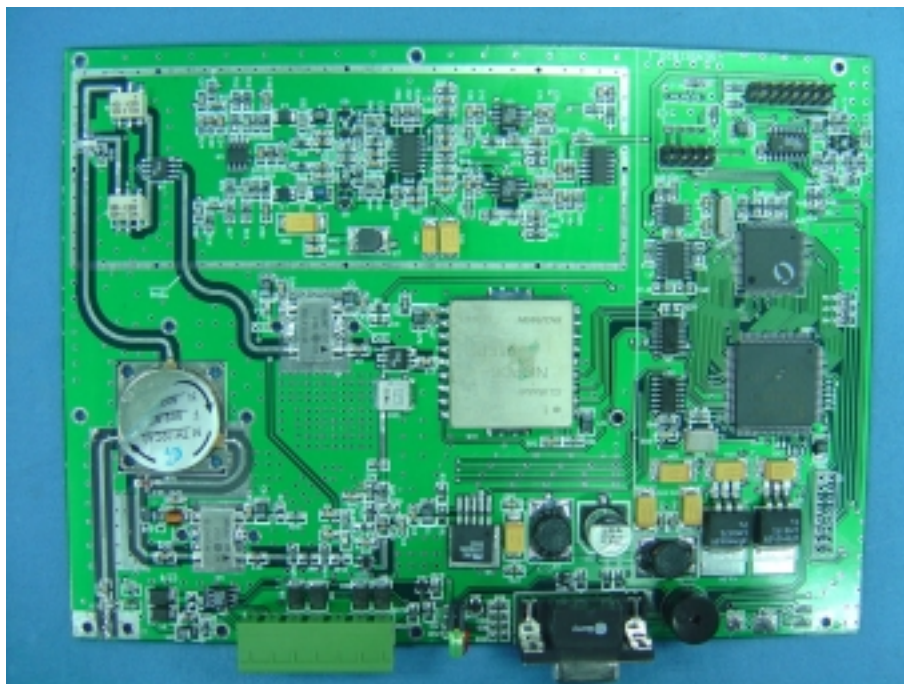
Figure 12 Main Board, Component Side