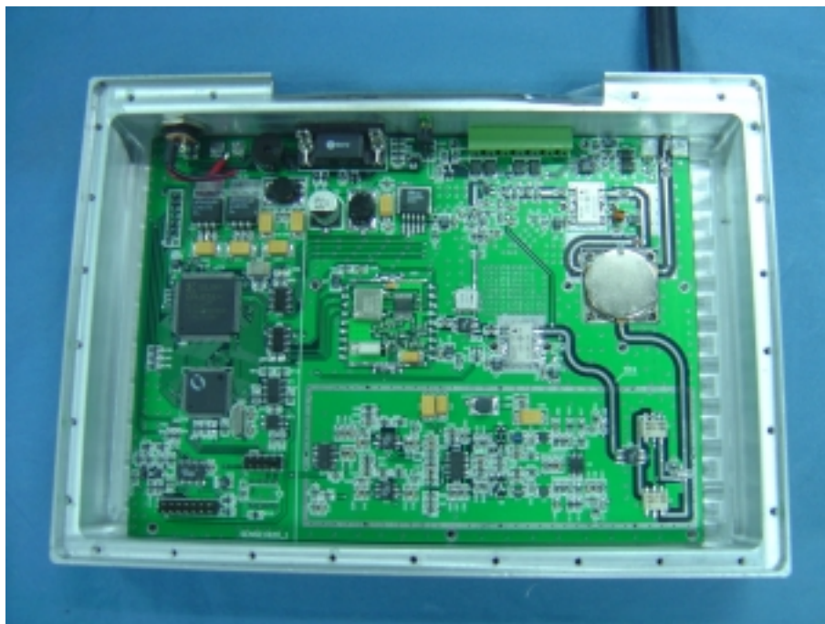
Figure 10 Main Board, Component Side