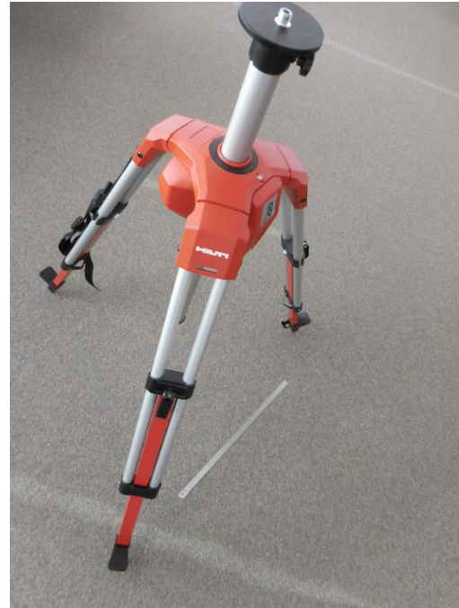
Side view 2