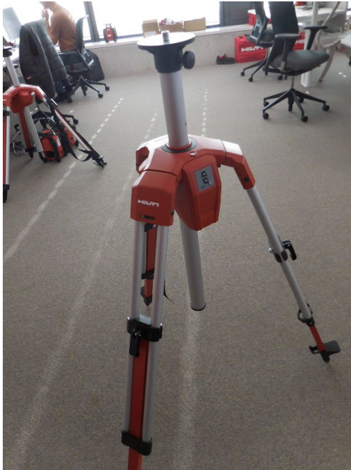
Side view 1