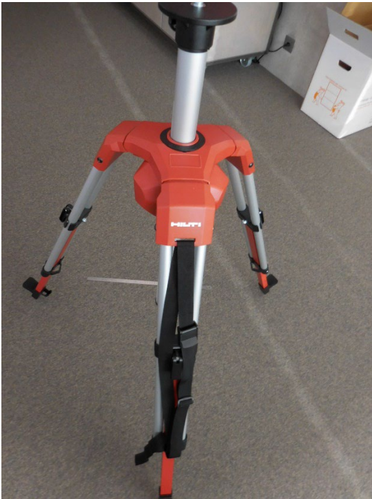
Side view 3