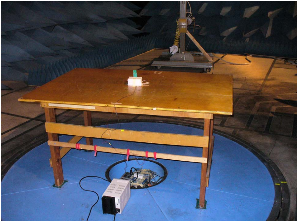
Figure 2: Radiated Emissions – Back View - 520