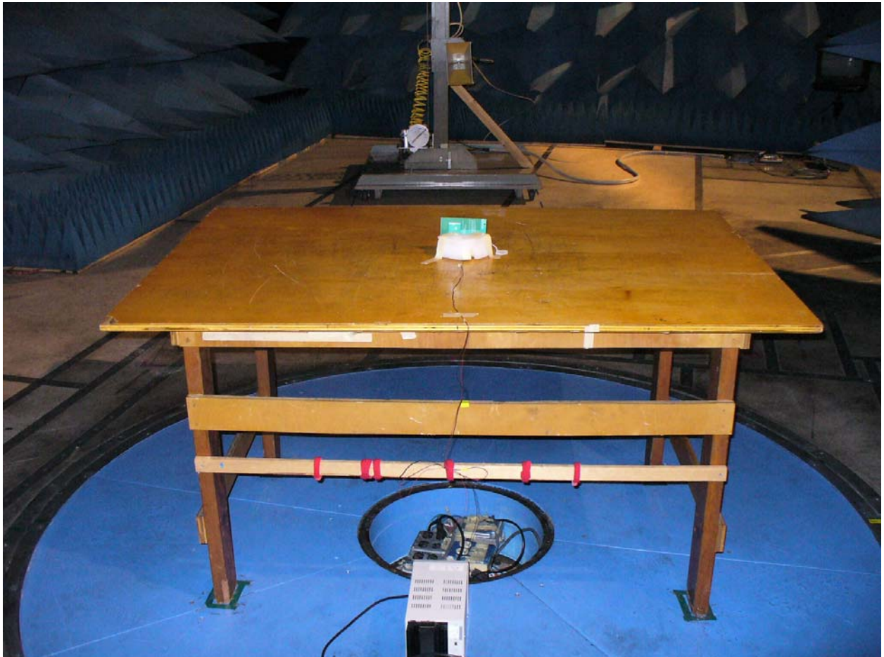
Figure 4: Radiated Emissions – Back View – 510 SOH