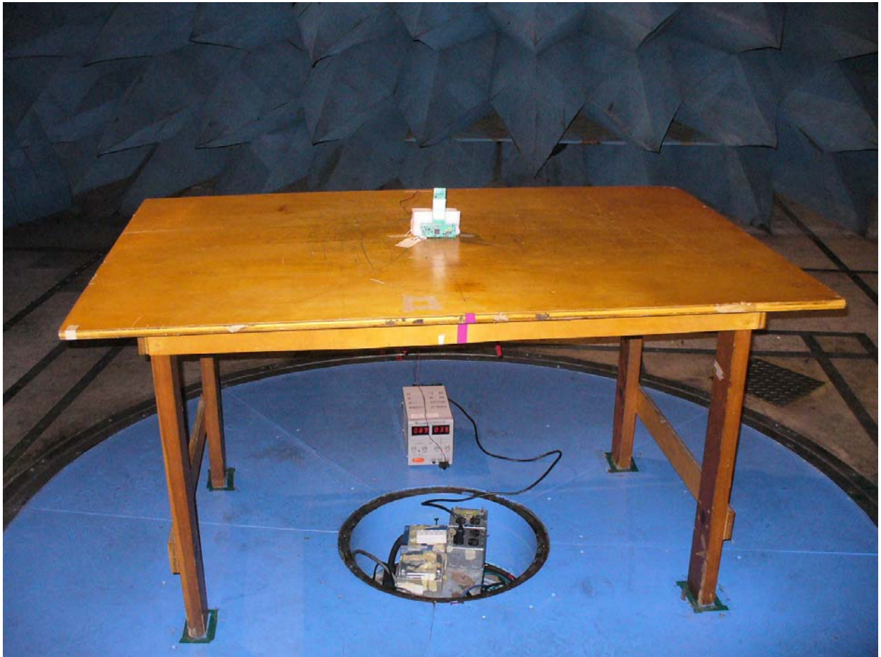
Figure 1: Radiated Emissions – Front View - 520