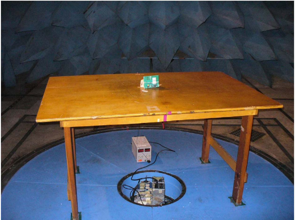
Figure 3: Radiated Emissions – Front View – 510 SOH