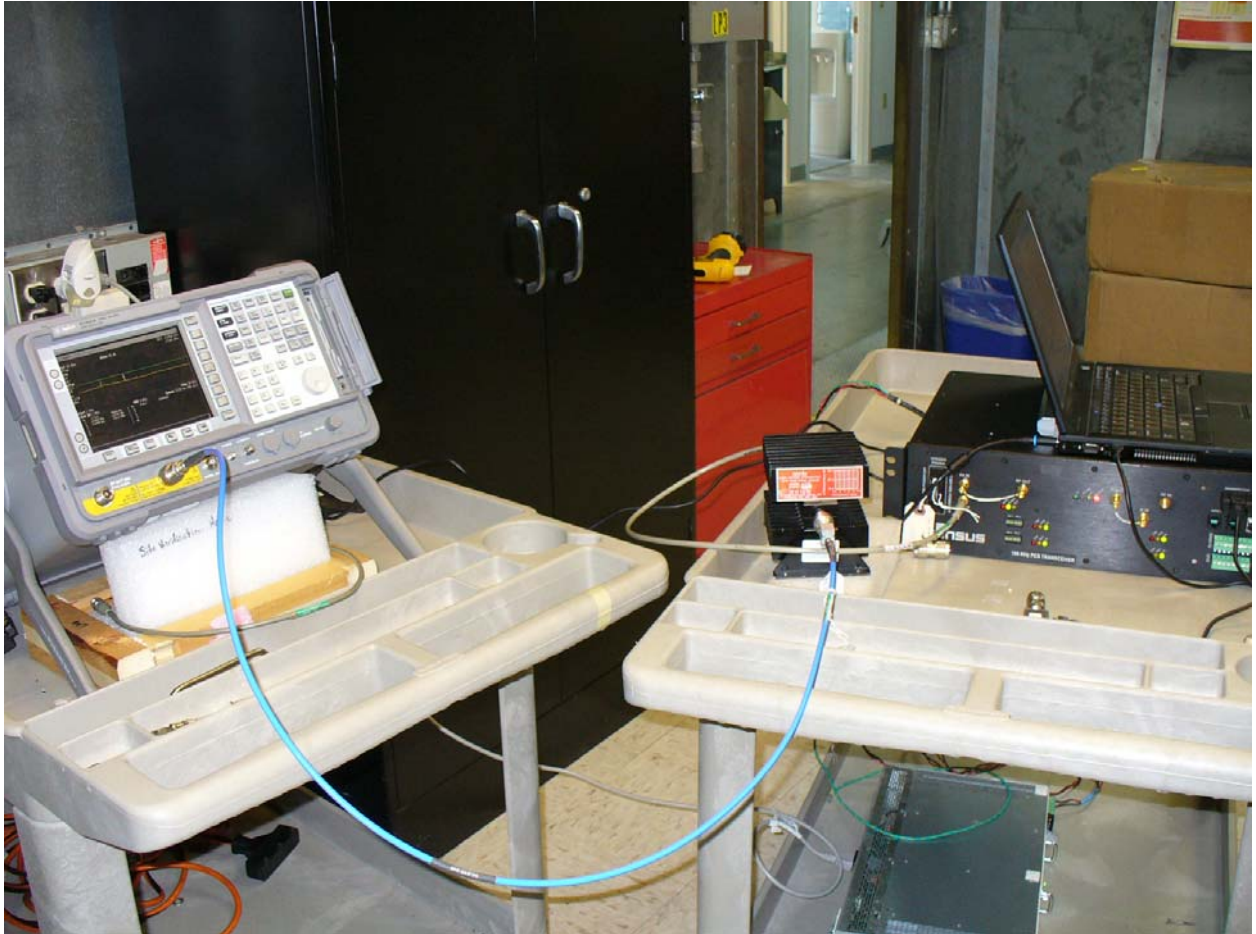
Figure 5: RF Conducted Emissions (Set Up 3)