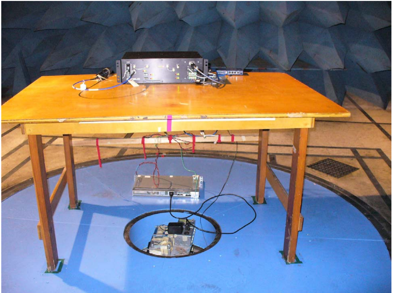
Figure 1: Radiated Emissions – Front View